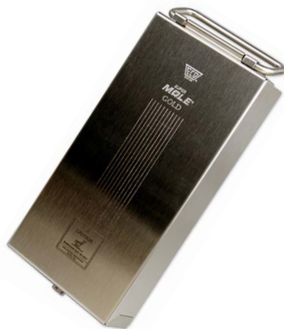
Figure 1 – External View