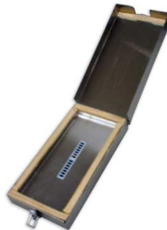
Figure 2 – Internal View