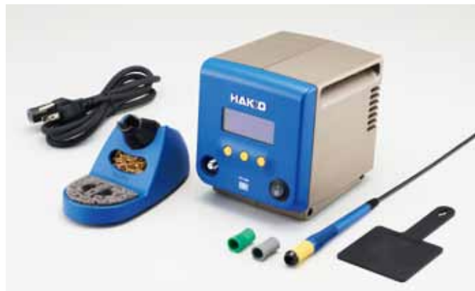
Station, Handpiece (FX-1001), Heat resistant pad, Power cord, Sleeve (green), Sleeve (gray), Iron holder, Instruction manual