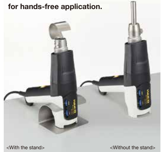
<With the stand>

Use of stand secures stability for hands-free application.