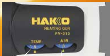
Temperature control knob Air flow control knob