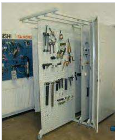
Cabinet style tool storage