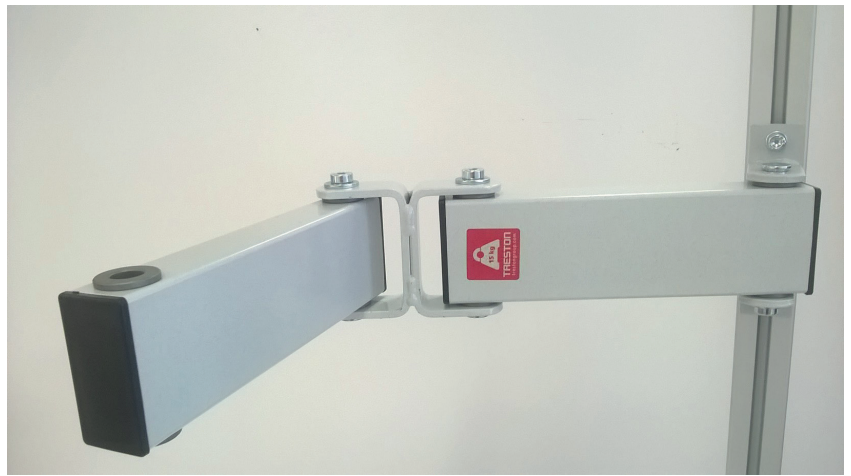
Arm adapter 890525-49 and a double arm 880010-49

Delivery time is 5 working days from Jyväskylä factory.