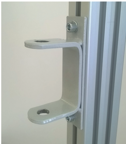
Arm adapter 890525-49