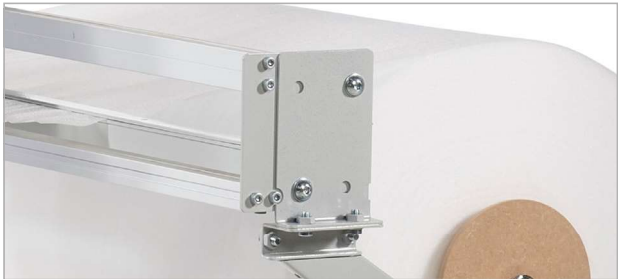
Bracket pair for cutter

Cutter PPC can be fitted to the packing material roll stand with the bracket pair. Height adjustable. Cutter is ordered separately.