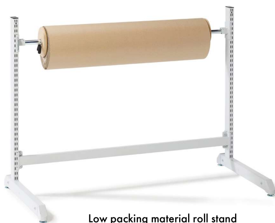
Low packing material roll stand