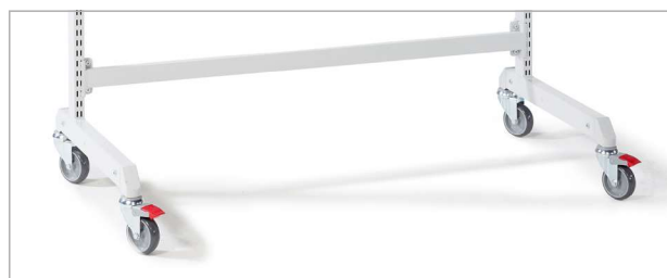
Castor set for packing material roll stands