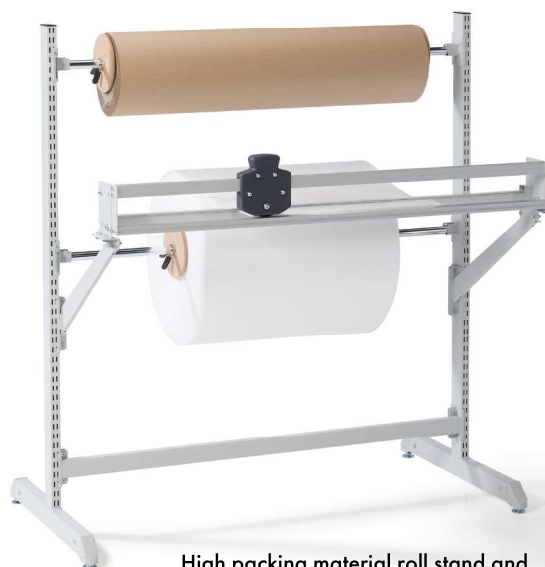
High packing material roll stand and bracket pair for cutter (page 83)

Low stand for one roll. The roll is adjustable in height. Axle diameter 25 mm. Max roll Ø 800 mm. Can be equipped with extra roll holder set, castor set and cutter PPC. Max load 40 kg per roll.