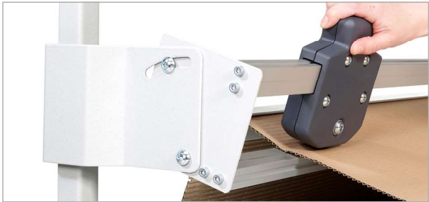
Fixing brackets for cutter

In order to obtain an ergonomic position, the cutters can also be affixed to the upright profiles of all the workbenches using these fixing brackets. The fixing brackets make the cutter both height and tilt adjustable, tilt 30 degrees. Cutter is ordered separately.