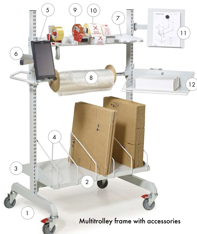
Multitrolley frame with accessories