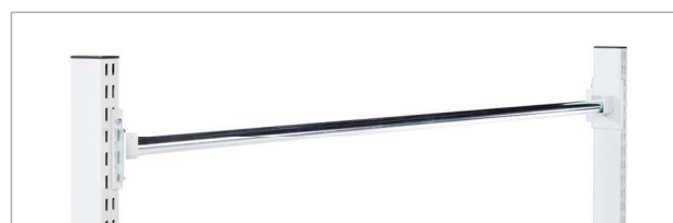
Extra roll holder set

Extra roll holder set for packing material roll stands. Including brackets. Axle diameter 25 mm, zinc electroplated. Max load 40 kg.