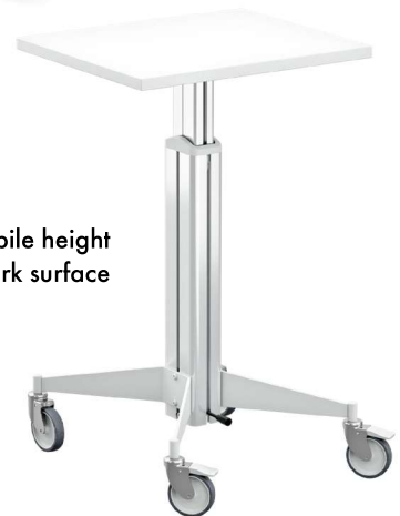
MLCT mobile height adjustable work surface