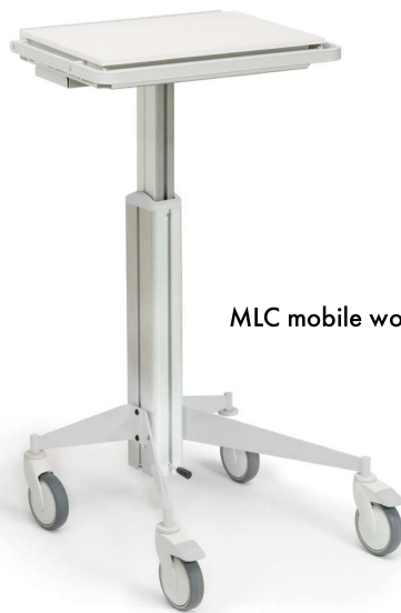
MLC mobile workstation

MLCT mobile height adjustable work surface is a compact sized additional work surface with easy gas spring height adjustment. It is ideal for tight spaces and tasks where easy manoeuvrability is a must. Optimal for handling light loads and small sized objects. Ideal also for laptop use. Suitable for technical and EPA environments where easy ergonomics and mobility are required.