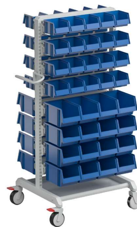
Basic trolley 1