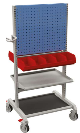
Basic trolley 2