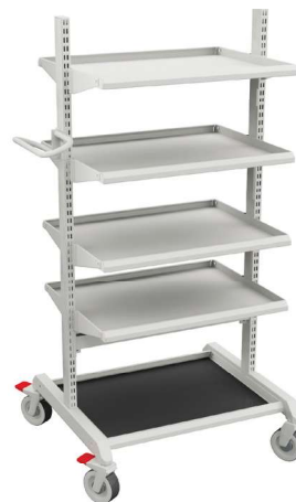
Basic trolley 3