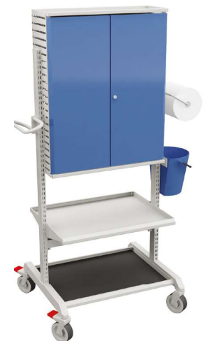
Basic trolley 4