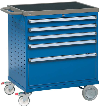
Service trolley Size 710 x 480 x 875 mm Max load 300 kg

Both sides of the trolley have standard, perforated panels that you can accessorise with brackets and mountings, to suit any application. Service trolleys are also equipped with two fixed castors (Ø 150 mm) and two swivel castors including brakes (Ø 100 mm).